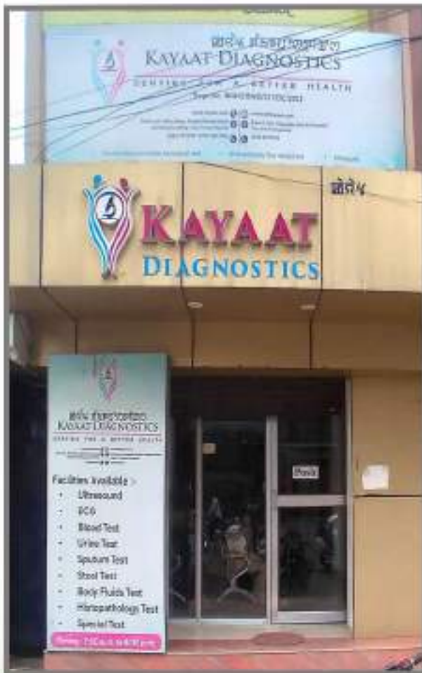
Kayaat Diagnostics, RIMS Road